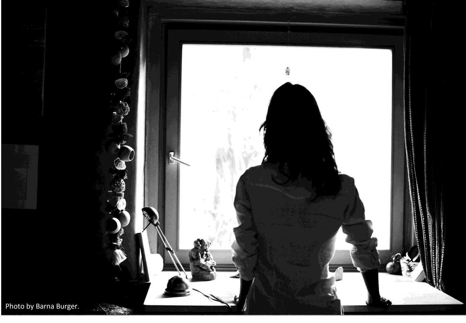
EXCERPT FROM THE BOOK